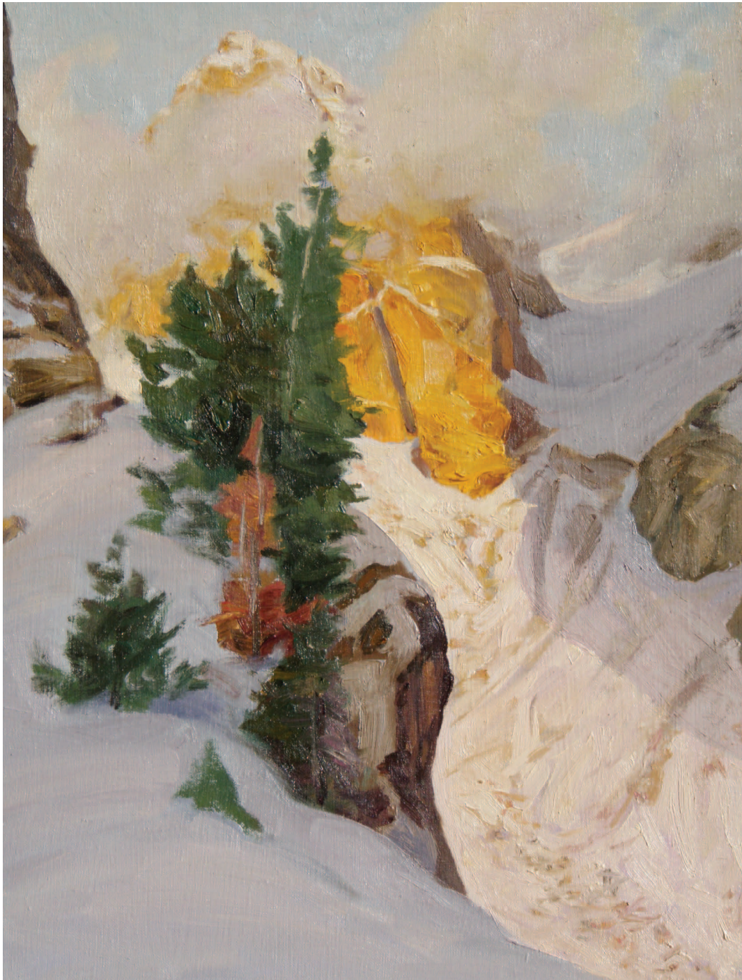
Joe Arnold, View from the Shoulder of Nez Perce , 2012, oil on canvas, 24 x 18 inches.

Comments from attendees included: the short talks let them take in a wide variety of topics in a relaxed atmosphere, all in one place; questions during the presentations often turned into expanded one-on-one discussions during the breaks; the high level of peer acknowledgement and celebration of work and accomplishments invigorated the creative process; it was very encouraging to see many new faces and to see the scope of the visual artist community in Wyoming; more CLICK! conferences in other locations around the state on a regular basis would be most welcome.