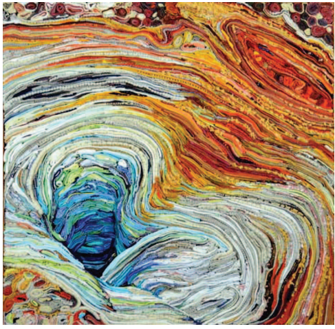
Georgia Rowswell, Paint Pot, Yellowstone , compressed fiber