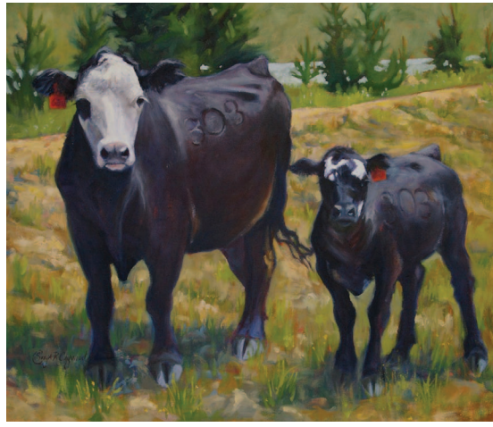
Sonja Caywood, Mercer Pair in Adelaide , oil