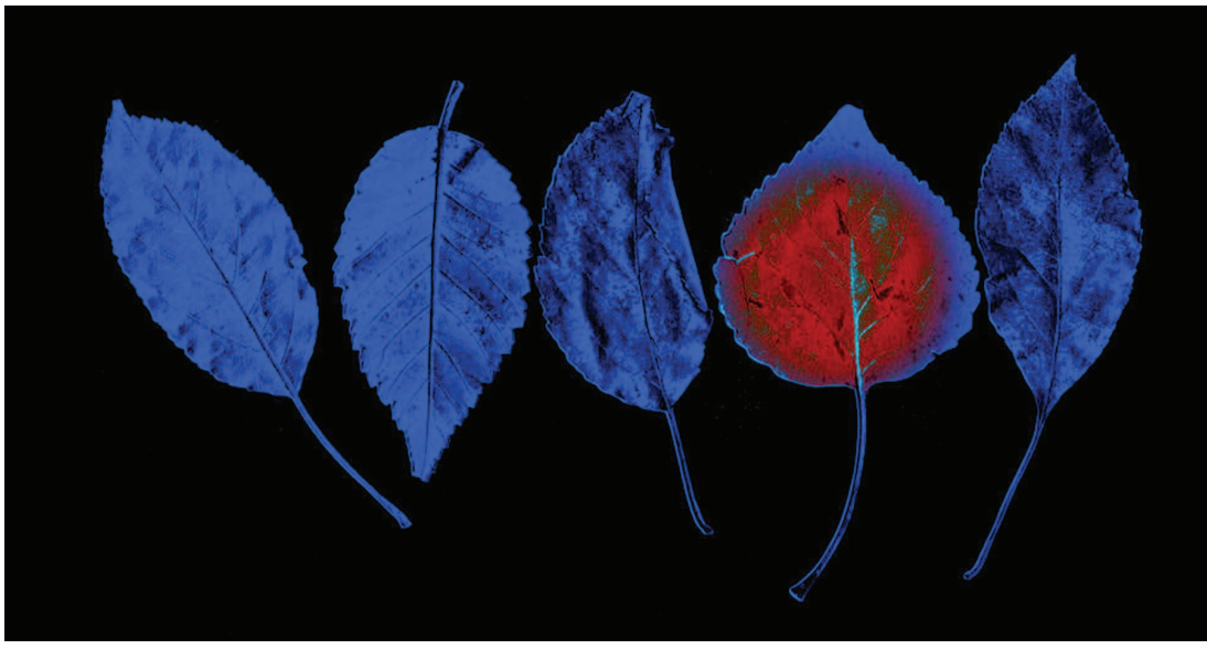
Tony James, Devil's Garden #2 , photograph