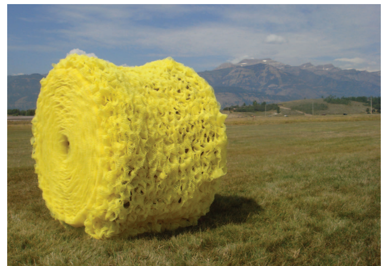
Suzanne Morlock, Silage , 2011, 55 x 8 x 55 inches; knitted reclaimed water-barrier construction fabric, found object.