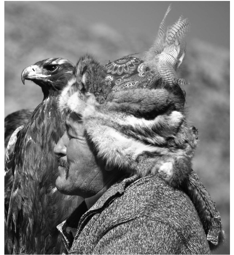
Cat Urbigkit, Aralbai , 2011, B&W photo, 18 x 12 inches.