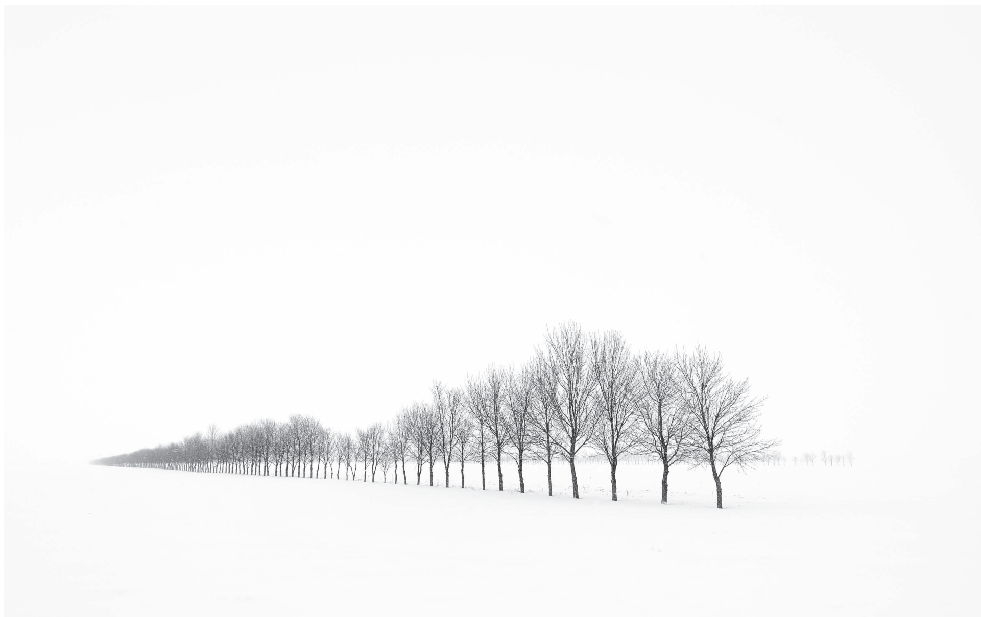
Chuck Kimmerle, Shelter Belt , 2012, B & W photo, 20 x 13 inches.