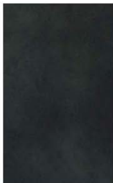
BLACK PAINT @ STEEL + EXTERIOR STRUCTURAL ELEMENTS