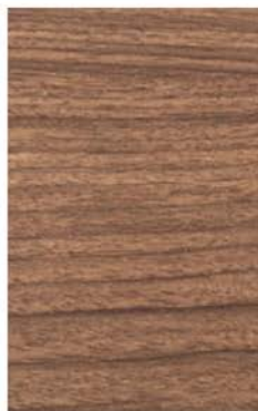
BIO GRAIN PURE + FREE FORM EXTERIOR PANELS