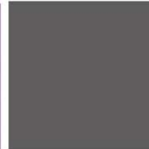
ACCENT PAINT/LOCKER COLOR