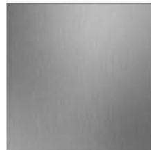
STAINLESS STEEL WALL PROTECTION