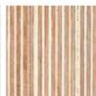
PLYWOOD AND END-GRAIN WOOD