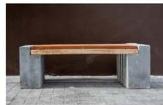
CONCRETE AND WOOD BENCH