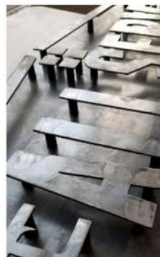
THREE DIMENSIONAL EXTERIOR SIGNAGE