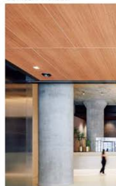
BIO GRAIN - PANEL LAYOUT