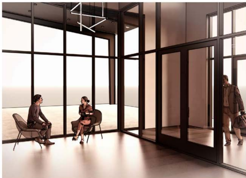
STANDARD INTERIOR FINISHES: