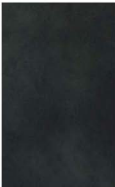
BLACK PAINT @ STEEL + EXTERIOR STRUCTURAL ELEMENTS