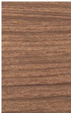
BIO GRAIN PURE + FREE FORM EXTERIOR PANELS