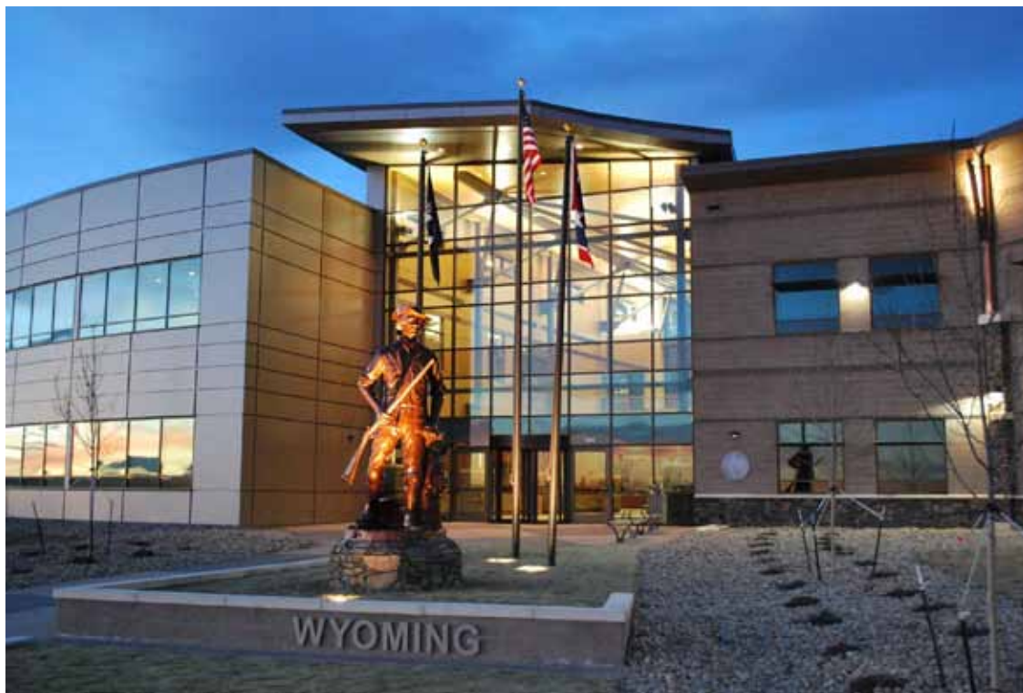
The Wyoming Military Joint Readiness Center, Cheyenne