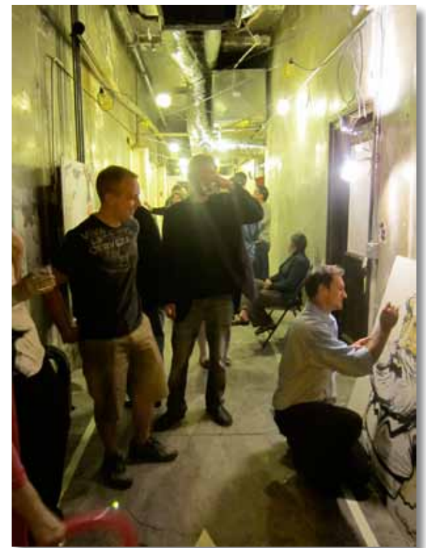
Artists do a "quick draw" at a fundraising event for LightsOn!, Cheyenne

AVA Kiln The arrival of a commercial gas kiln at Gillette's AVA Community Arts Center will allow area potters to create pots more than three feet wide, as well as allowing numerous smaller pieces to be fired at once. Grants from the City of Gillette