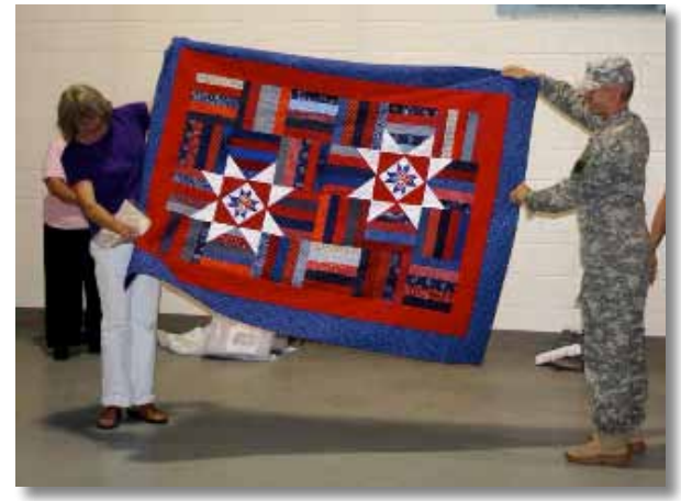
Quilts were presented to returning National Guard soldiers in a special ceremony held at the Rock Springs Armory

The meaning of the colors and the stars and stripes of the flag – red for hardiness and valor in work, blue for perseverance and white for clarity in beliefs; stars for what is divine in us and stripes representing rays of sunlight—hold true for the members of Star Valley Piece Makers, who are indeed coloring the winter with the caring warmth of creativity and encouragement.