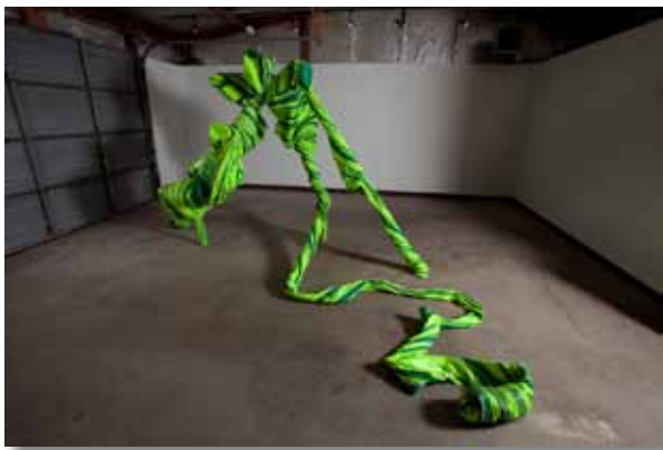
Abbie Miller, Man Made , 2010, sculpture, fabric, 87.5 x 112 x 98 inches