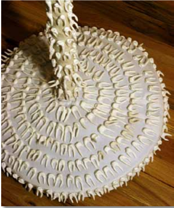
Jenny Dowd, lamp with ceramic teeth detail, 2010