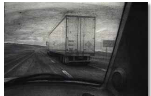
Shelby Shadwell, Economy , 2009, charcoal, graphite, pastel on paper on panel