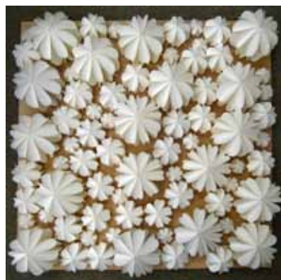
Diana Baumbach, Groundcover , 2008, paper, wood, plexi, 40 x 40 x 8 inches