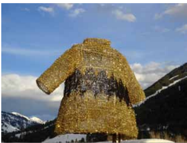
Suzanne Morlock, Sweater , 2010, mylar by-product, knitting technique, 13 x 9 x 7 feet