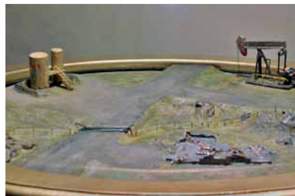
David Jones, Well Pad T459 , 2009

David Klaren's Dire Wolf Studios is in a spacious, old, two-story warehouse. His large drawings of dragonflies, mud crabs, pinecones and skeletal horses occupy almost every inch of wall space. His pen-and-ink drawings are spread out across a table. On the shelves are various fish sculptures awaiting completion.